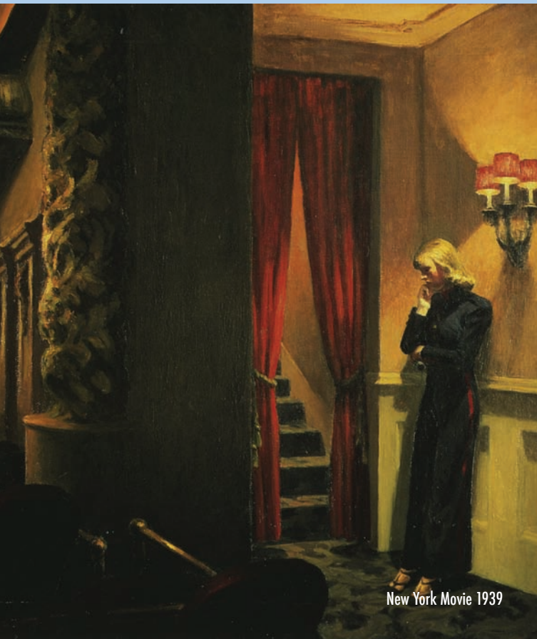
New York Movie 1939