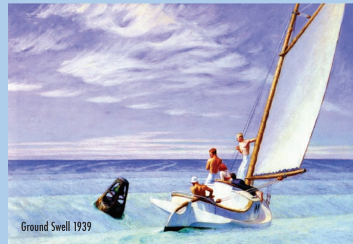
Ground Swell 1939

Austin Museum of Art 823 Congress Avenue Austin, TX 78767