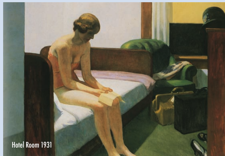
Hotel Room 1931